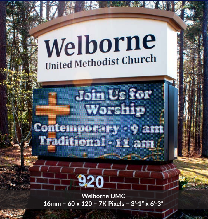
Welborne UMC 16mm - 60 x 120 - 7K Pixels - 3'-1" x 6'-3"