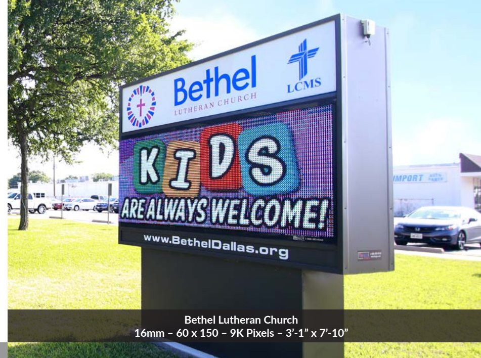
Bethel Lutheran Church 16mm - 60 x 150 - 9K Pixels - 3'-1" x 7'-10"

"Everyone Welcome" "Fall Festival this Saturday" "Bible Study 7pm" "The Lord helps those who help others" "Food Drive Saturday 8-11am"