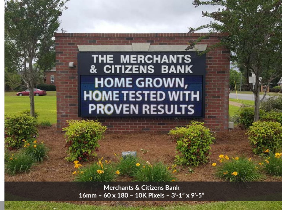
Merchants & Citizens Bank 16mm - 60 x 180 - 10K Pixels - 3'-1" x 9'-5"

“Free Checking” “Low Mortgage Rates” “Free Gift with New Accounts” “Easy Online Banking” “Stuck in Traffic? Get $100 for a New Account!”