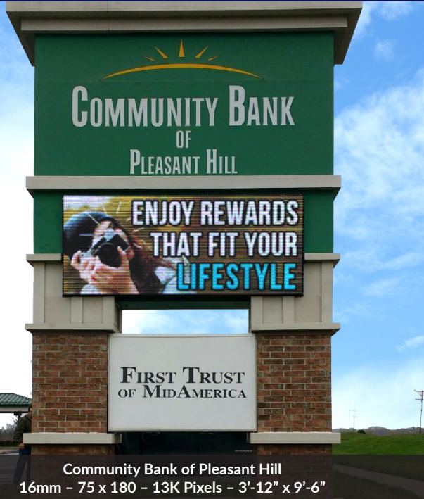
Community Bank of Pleasant Hill 16mm - 75 x 180 - 13K Pixels - 3'-12" x 9'-6"