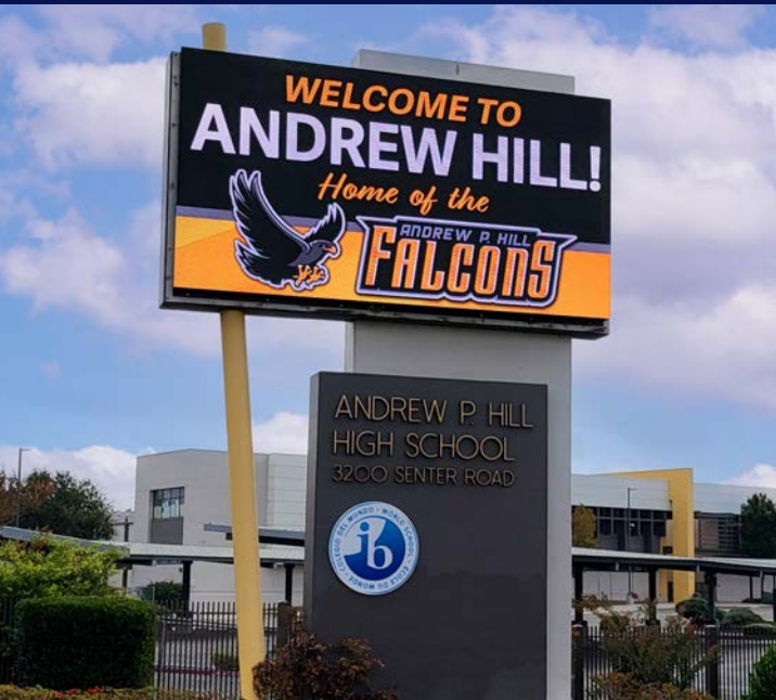
Andrew Hill High School 8mm - 390 x 750 - 29K Pixels - 10'-3" x 19'-8"