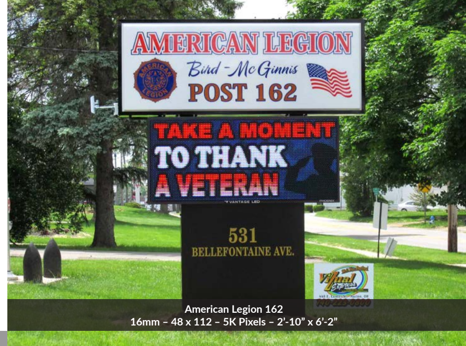
American Legion 162 16mm - 48 x 112 - 5K Pixels - 2'-10" x 6'-2"

“Friday Night Fish Fry” “BBQ Fundraiser Sat 3pm” “Bingo Night!” “Charity Pancake Breakfast 8am” “Sunday Night Dance 7-10pm”