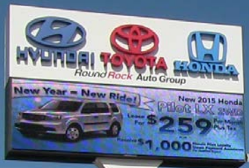
Round Rock Auto Group 20mm – 72 x 240 – 17K Pixels – 5'-0" x 16'-0"