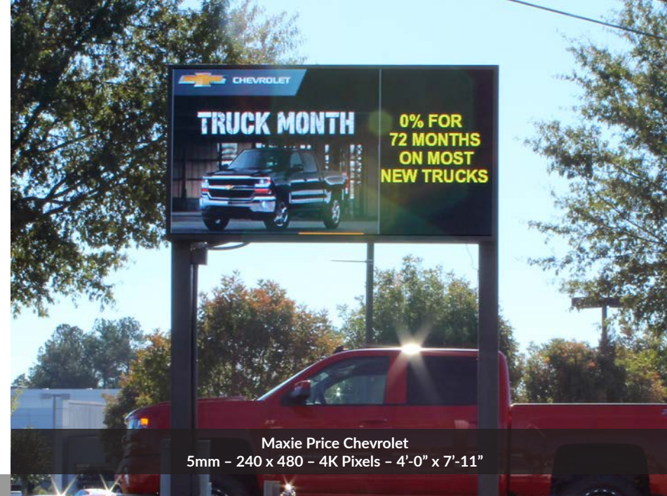
Maxie Price Chevrolet 5mm – 240 x 480 – 4K Pixels – 4'-0" x 7'-11"

“Free A/C Check” “New Models Just Arrived!” “Annual Clearance Event” “$1500 off MSRP on Select Models” “20% off Premium Oil Change 3-5pm”