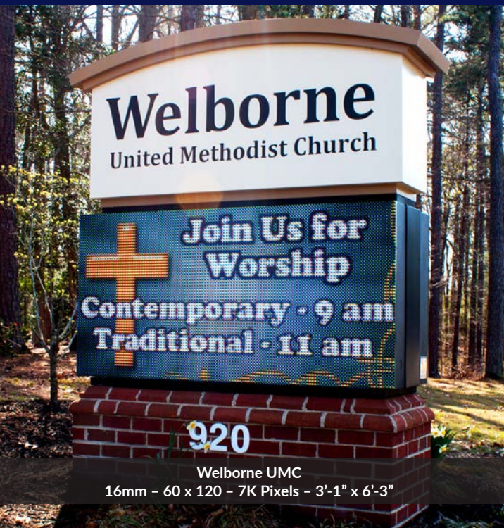
920 Welborne UMC 16mm - 60 x 120 - 7K Pixels - 3'-1" x 6'-3"