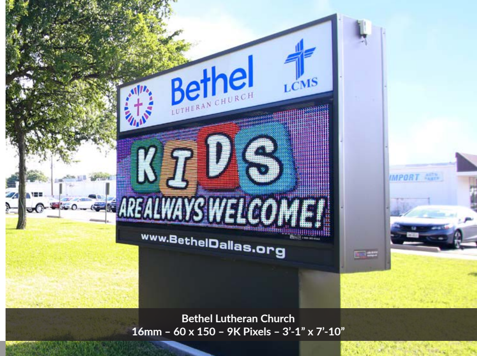
Bethel Lutheran Church 16mm - 60 x 150 - 9K Pixels - 3'-1" x 7'-10"

"Everyone Welcome" "Fall Festival this Saturday" "Bible Study 7pm" "The Lord helps those who help others" "Food Drive Saturday 8-11am"