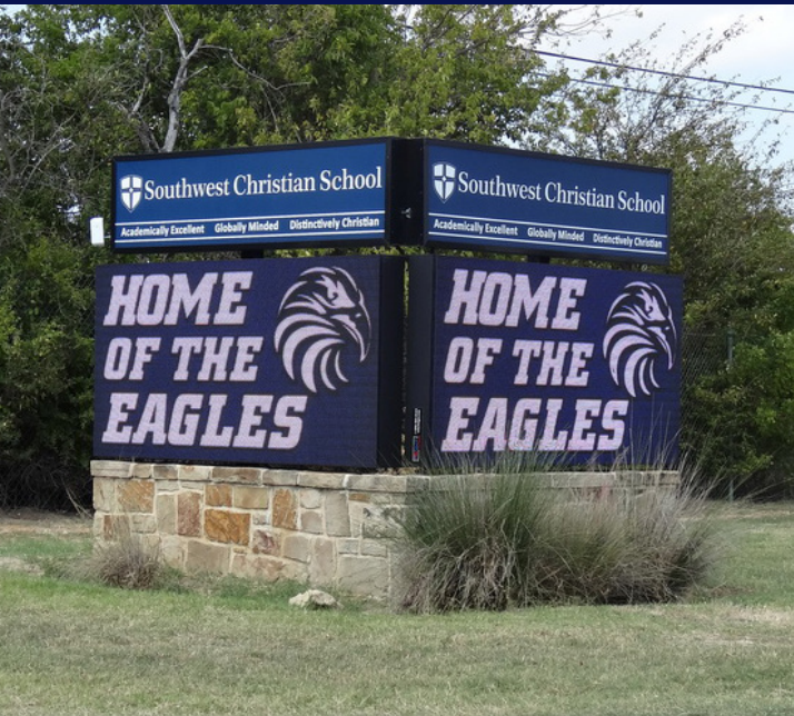
Southwest Christian School 12mm – 100 x 200 – 20K Pixels – 4'-0" x 7'-11"