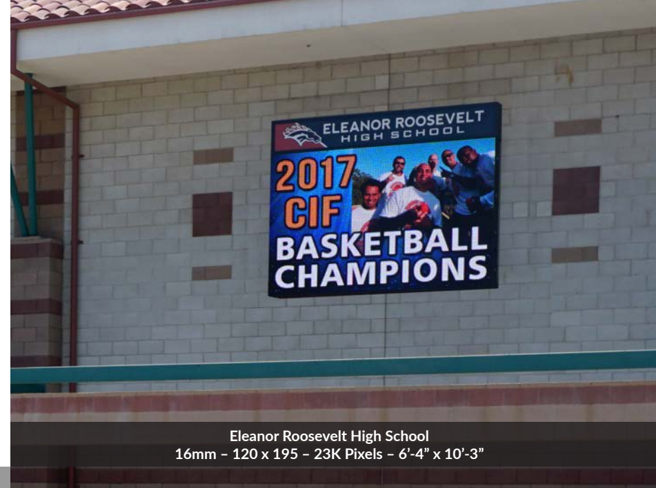
Eleanor Roosevelt High School 16mm – 120 x 195 – 23K Pixels – 6'-4" x 10'-3"