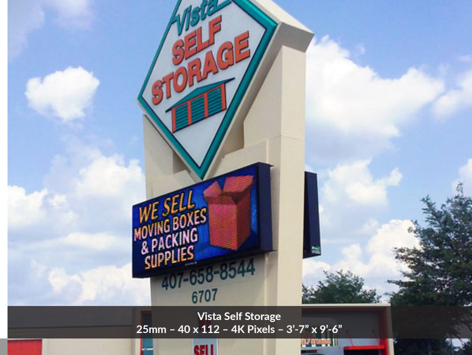
Vista Self Storage 25mm - 40 x 112 - 4K Pixels - 3'-7" x 9'-6"

“24 Hour Access” “First Month FREE!” “Climate Controlled Units” “We Give Military Discounts!” “Save 10% on truck rentals 3-5pm”