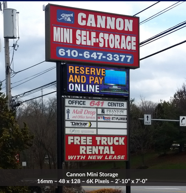
Cannon Mini Storage 16mm - 48 x 128 - 6K Pixels - 2'-10" x 7'-0"