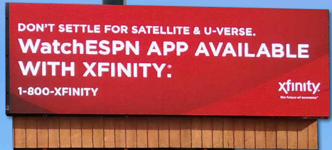
Richmond Hill, GA Traditional Full Color Series 20mm - 144 x 448 / 10' x 30' / 65K Pixels