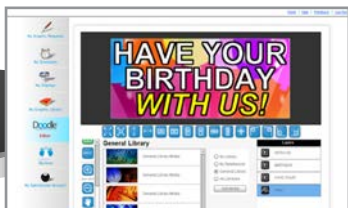
Doodle Message Editor