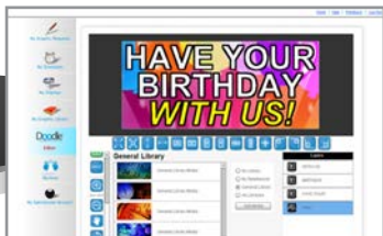
Doodle Message Editor